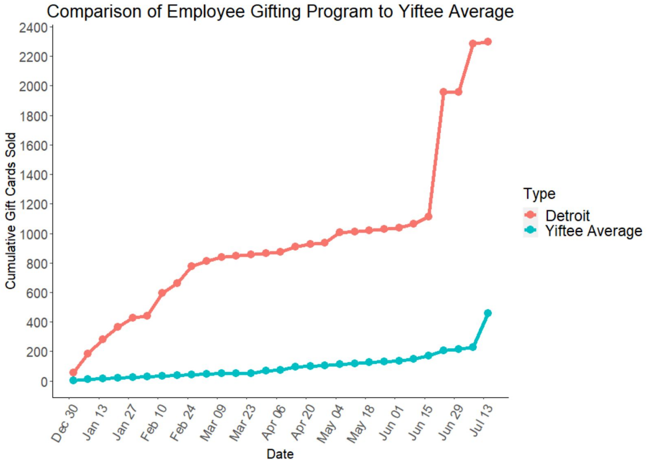
Figure 2: Cumulative Number of Cards Sold in Detroit, Michigan compared to Yiftee Average

Another way to support the community as an employer is to purchase local gift cards for your employees, rather than buying national brand or e-commerce cards. We have seen employers do this in a variety of ways including, implementing small business and community gift cards for holiday gifts, anniversary gifts, as well as ongoing employee rewards and spot bonuses. Shifting the way companies reward their employees will not only help the community in the long term but also give employees a gift that is versatile and allows them to customize their experience. Figure 2 shows the potential impact of employee gifting programs.